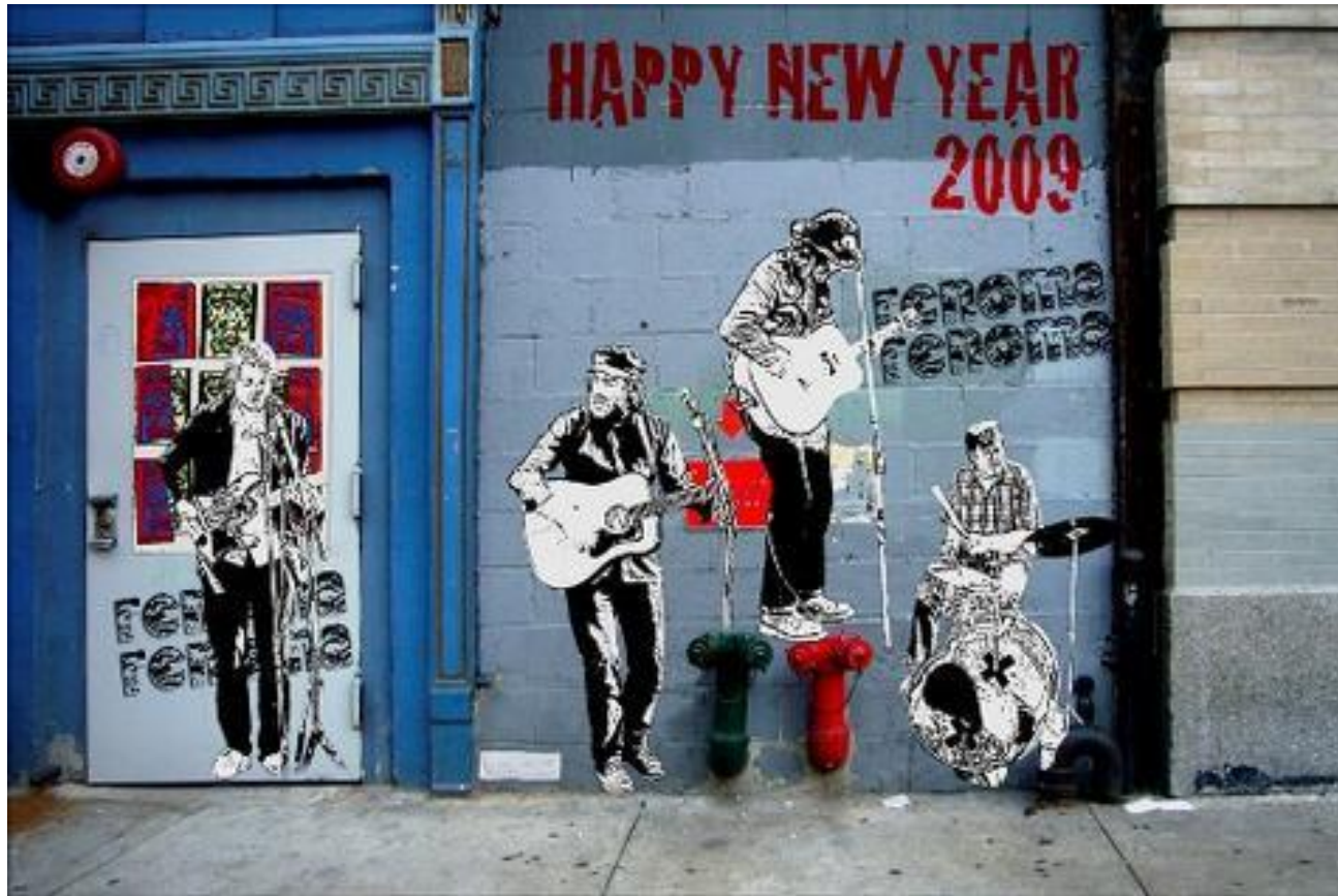
Street Art Collection – 809 31.4" x 47.2"