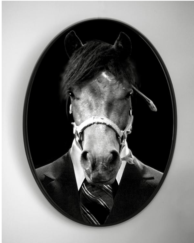
Mythology Collection – Horse 593 39" x 31"