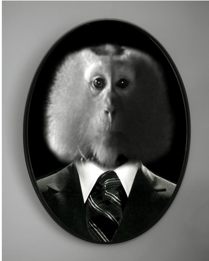
Mythology Collection – Monkey 590 39" x 31"