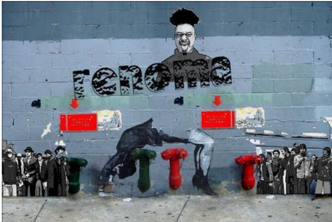
Street Art Collection – 810 31.4" x 47.2"